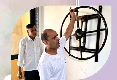
Upper Limb Exercise