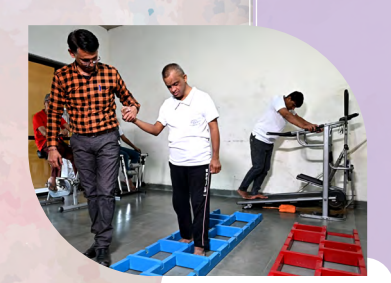
Lower Limb Exercise