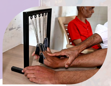
Upper Limb Exercise